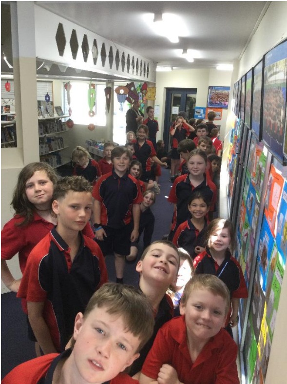
Room 1 sharing with their Big Buddies