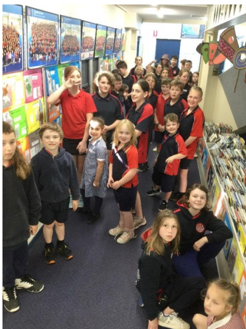
Room 3 sharing with their Big Buddies