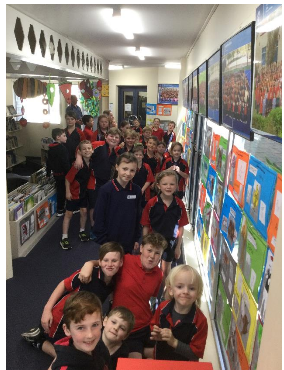
Room 2 sharing with their Big Buddies